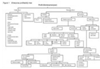
Figure 1: Enterprise profitability tree